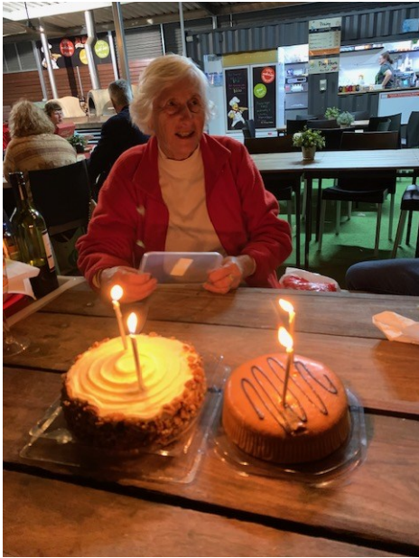
Singers for Dorothy