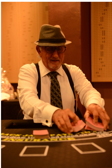
ROD BLACKJACK SHARK