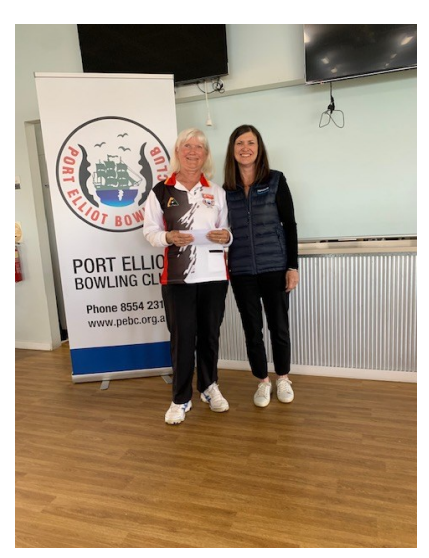
WINNERS OF THE DAY