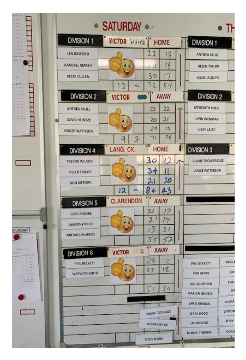
LET'S KEEP IT UP