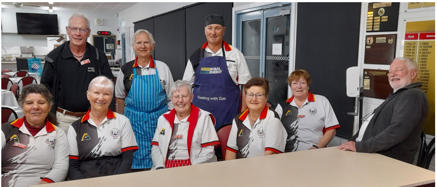
The catering team . What a great team of people.